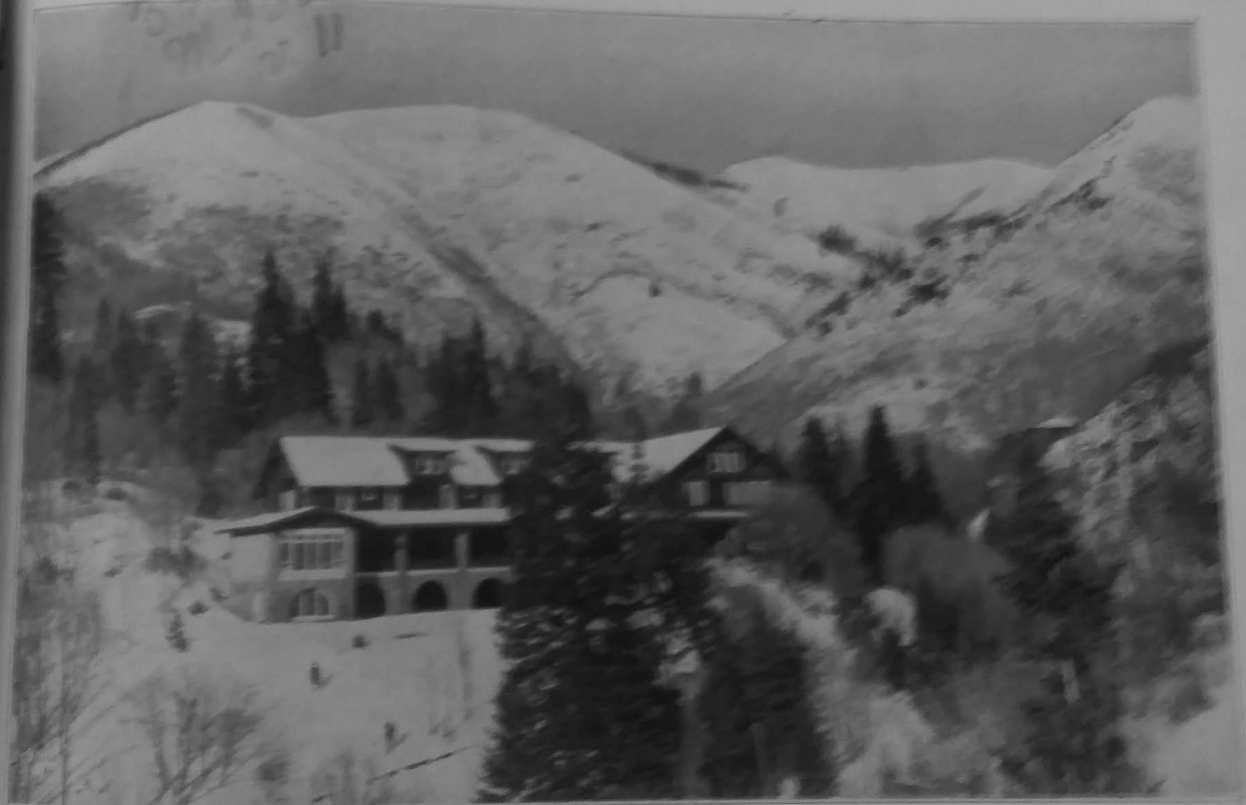
Pinecrest Inn—One Hour's Drive from Salt Lake City Over a Well Kept Mountain Road.